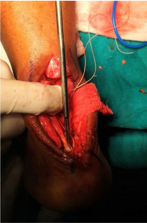
Fig. 4. FHL tendon fixed with tenodesis screw

injury to the neurovascular bundle. The FHL should be traced distally and dissected proximally for appropriate tendon length and tendon excursion. The FHL tendon can be harvested distally from the same incision, so no different incision is required. The calcaneum tunnel is oblique, in centre and 1 cm-1.5 cm anterior to ta tendon insertion. The length of the FHL tendon in the tunnel should be pre-measured so that the tensioning of the tendon can be done accordingly. The endobutton