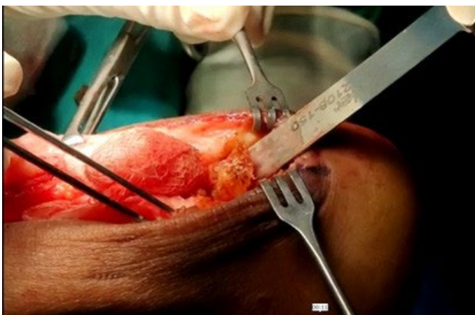
Fig. 1. Beveling of the calcaneal tuberosity with the saw blade

The patient was positioned prone with 10-150 of knee flexion and a mid-thigh tourniquet was applied. The incision was given over the TA tendon extending 7 cm-8 cm proximally from the insertion site just proximal to the proximal TA stump. The dense fibrous tissue at the TA tear site was excised. The proximal TA tendon stump was identified and 1 cm stump of Achilles was debrided. The TA tear gap was 8 cm. There was no distal stump of the TA tendon at the insertion site. The superior part of the posterior calcaneum tuberosity (Haglund deformity) was resected in a beveled manner from posterior-inferior to the anterior superior direction with help of the saw blade (Fig. 1). The FHL tendon was identified as passing lateral to medial direction deep to the Achilles tendon and stretching led to great toe flexion movement. The FHL tendon transfer insertion site was marked 1 cm-1.5 cm anterior to the Achilles tendon insertion on the superior beveled surface of the calcaneum. The FHL tendon was traced as distally possible from the same incision. The