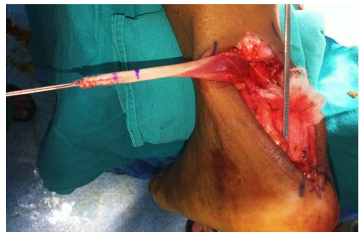
Fig. 2. Depicting the dissected FHL tendon with traction stitch

The surgeon should be cautious regarding the neurovascular bundle, lying in close proximity. Blunt dissection is advisable to prevent