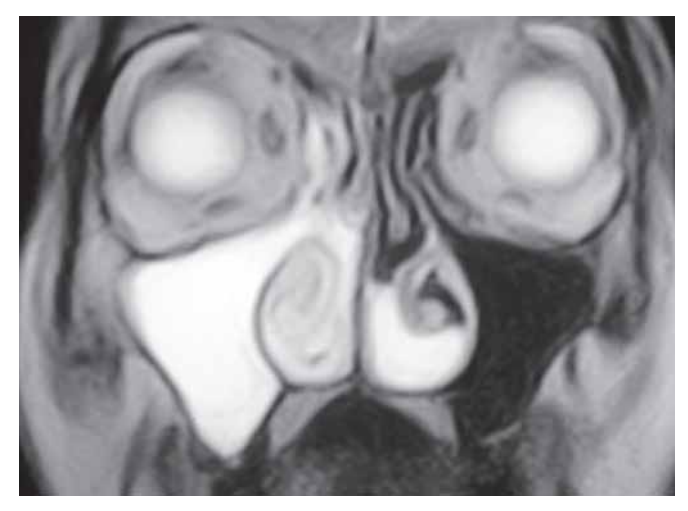
Fig. 2: MRI paranasal sinuses (axial section)—T2-weighted image showing hyperintense mass involving right maxillary antrum extending to right nasal cavity and another hyperintense mass in left nasal cavity along its floor

A diagnosis of right antrochoanal polyp and a nasal polyp in left nasal cavity, probably arising from posterior end of inferior turbinate, was made. Patient was planned for endoscopic surgery under general anesthesia. Microdebrider (Xomed MedtronicXPS3000, Jacksonville, Florida, USA) was used to remove the right nasal polyp and then the pedicle between antral and choanal part was removed. Cystic antral part was completely removed using a 45° endoscope and a curved debrider blade (RAD60 Xomed Medtronic, Jacksonville, Florida, USA). The remaining part was then pushed posteriorly into the nasopharynx and delivered via oral cavity. This brought along with it the polyp on the left side and it was seen to